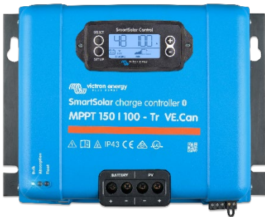
SmartSolar Charge Controller MPPT 150/100-Tr VE.Can with optional pluggable display