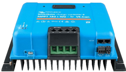
SmartSolar Charge Controller MPPT 150/100-Tr VE.Can without display