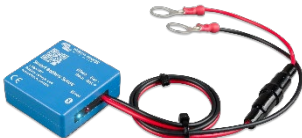
Bluetooth sensing: Smart Battery Sense