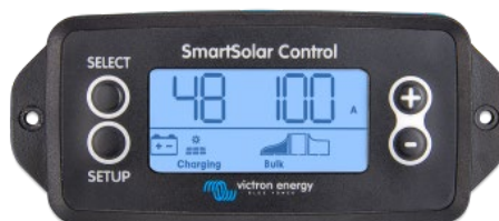
SmartSolar pluggable display

Simply remove the rubber seal that protects the plug on the front of the controller, and plug-in the display.