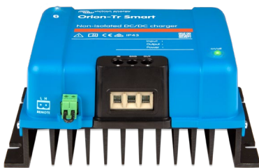
Orion-Tr Smart non-isolated 12/12-30