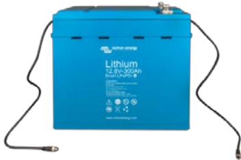
12,8V 300Ah LiFePO 4 Battery

With Bluetooth cell voltages, temperature and alarm status can be monitored. Very useful to localize a (potential) problem, such as cell imbalance.