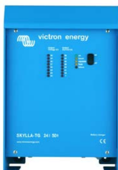
Skylla TG 24 50