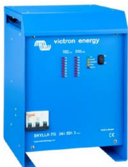
Skylla TG 24 50 3 phase

To learn more about batteries and charging batteries, please refer to our book 'Energy Unlimited' (available free of charge from Victron Energy and downloadable from www.victronenergy.com ).