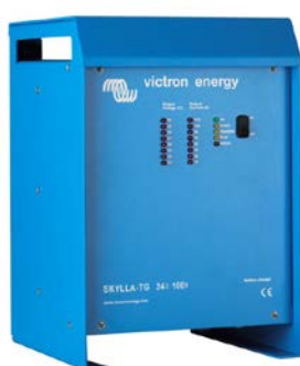
Skylla TG 24 100