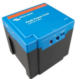
12.8 V, 30Ah