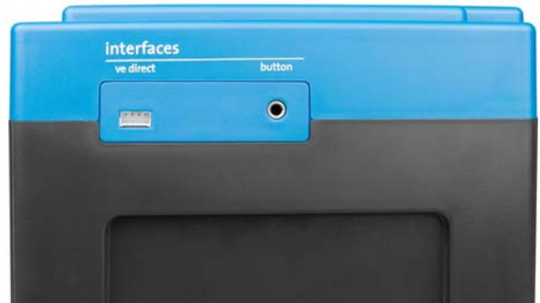
VE.Direct and push-button