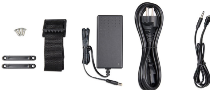
Fixing strap Adapter Power cable Push-button with cable (2m) and dual-colour LED