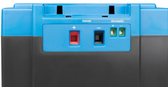
High capacity output (mover) and low capacity output (domestic)