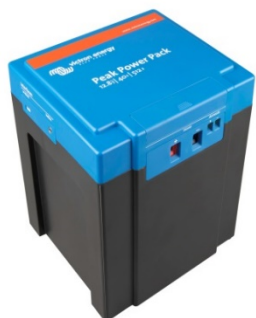
12.8 V, 40Ah