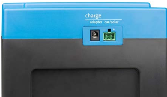
Adapter and input vehicle / solar panel (car/solar) (socket for the car/solar input comes supplied)