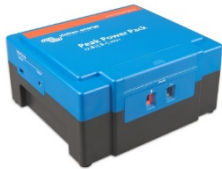
12.8 V, 8Ah