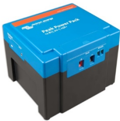
12.8 V, 20Ah