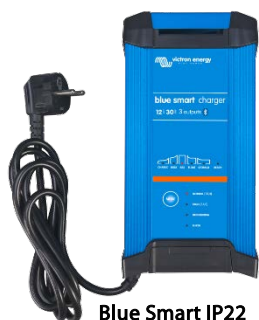
Blue Smart IP22 12/30 (3)