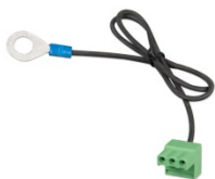
Connector with preassembled DC minus cable (included)