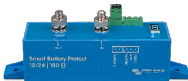
Smart BatteryProtect BP-100