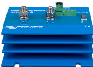
Smart BatteryProtect BP-220