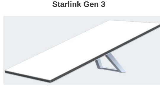
Starlink Gen 3

Mobile Internet Example Setup Starlink Gen 3 w/ DC Conversion Kit Applicable to MMH Starlink Bundles Created By: Casey Dugan MobileMustHave.com