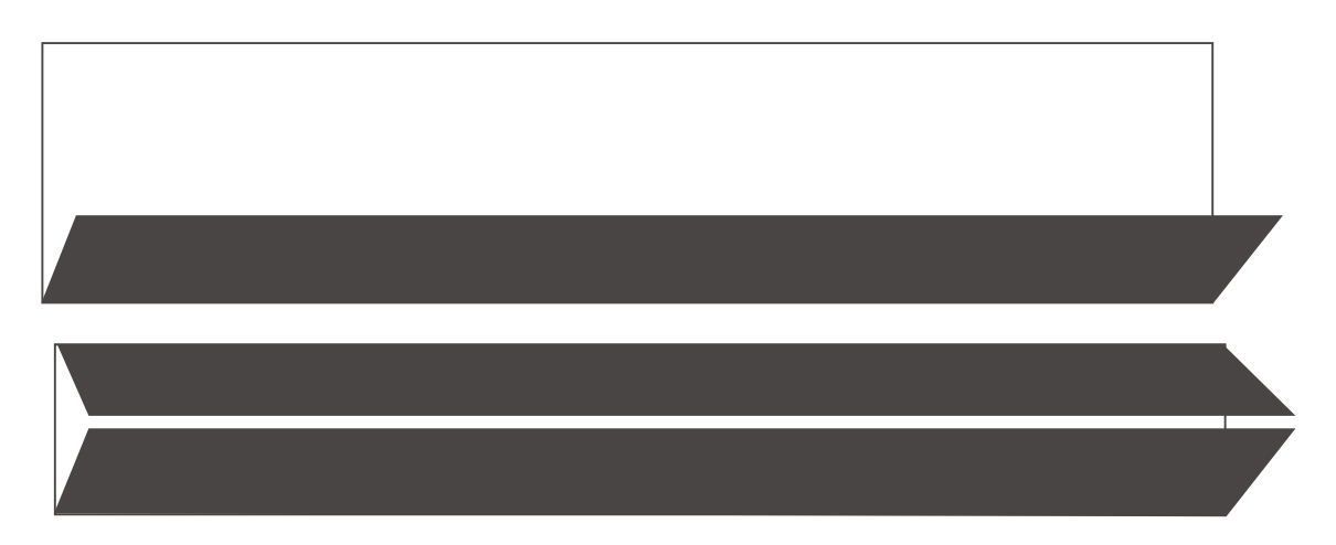
Press 44" x 21/2" fabric strips