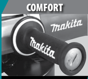
Lower vibration side and rear handle for more comfort and control