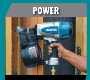
More power and less weight for increased versatility