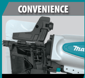
Easy access nose design to clear jammed nails