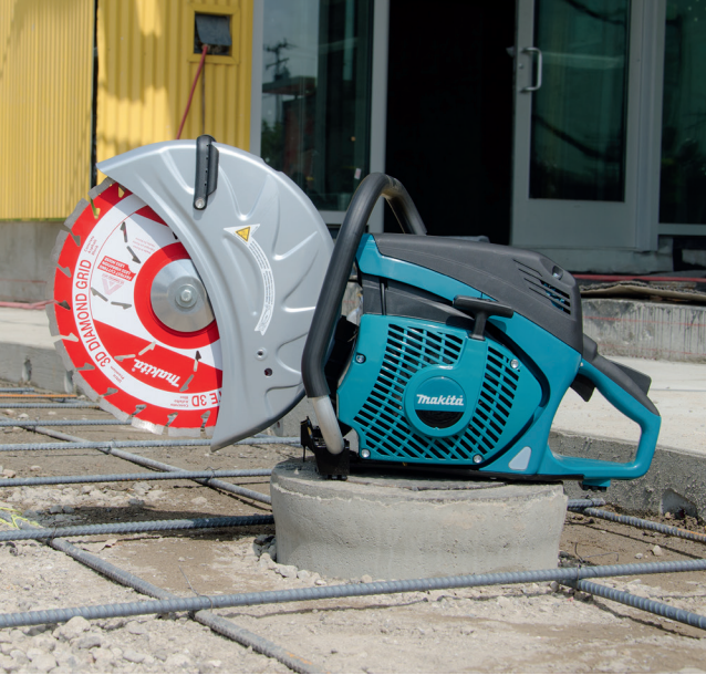
(Shown with optional diamond blade)