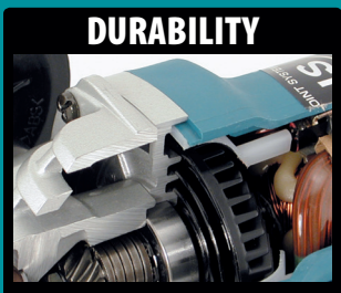
Labyrinth construction, zig-zag varnish and thicker coil wires for longer tool life