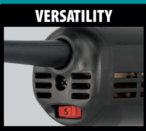
Variable speed control dial enables user to match the speed to the application

SJS™ technology is a mechanical clutch system that helps prevent motor and gear damage