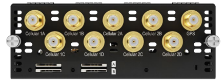
2x 5G Modules