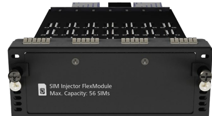
SIM Injector FlexModule (EXM-SIM-BK56)