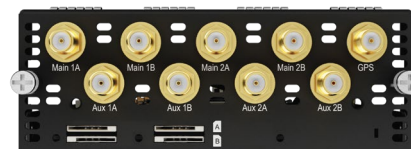
2x LTE-A Pro Module (CAT-18)