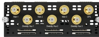
3x LTE-A Module (EXM-3LTEA)