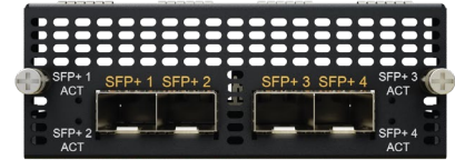
4x SFP+ Module (EXM-4F)

* Module can be configured with LAN or WAN ports as needed.