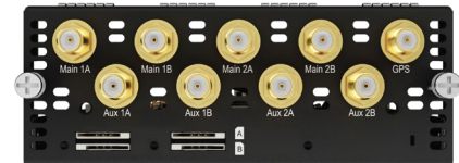
2x LTE-A Pro Module (EXM-2GLTE-G)