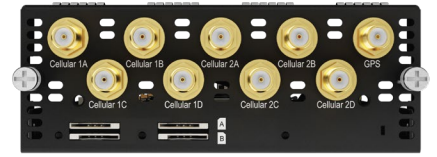
2x 5G Modules