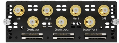
3x LTE-A Module (EXM-3LTEA)