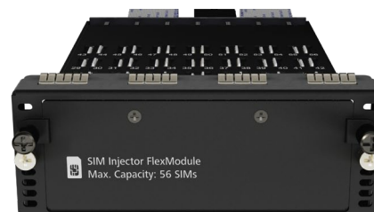
SIM Injector FlexModule (EXM-SIM-BK56)