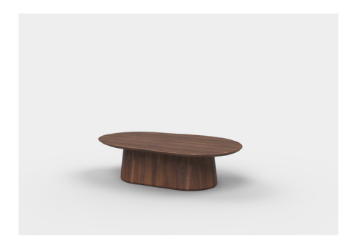
RHY114L - 1147L x 730D x 300H (mm) 45L x 29D x 12H (inches)