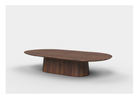
RHY170H - 1707L x 878D x 350H (mm) 67L x 35D x 14H (inches)