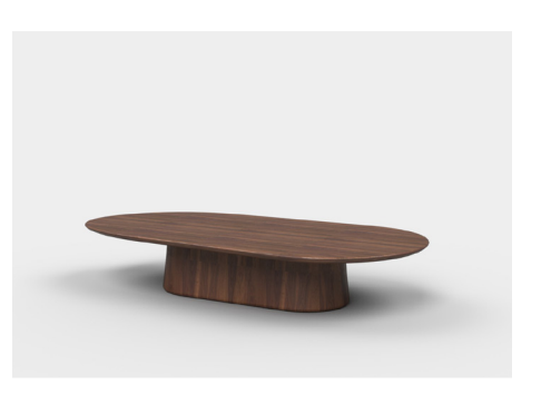
RHY170L - 1707L x 878D x 300H (mm) 67L x 35D x 12H (inches)