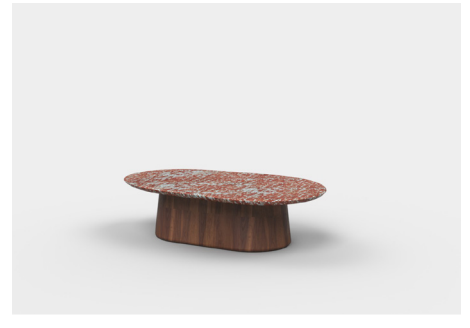
RHY114L_1 - 1147L x 730D x 300H (mm) 45L x 29D x 12H (inches)