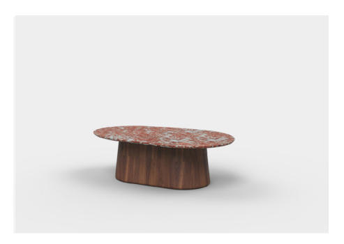
RHY114H_1 - 1147L x 730D x 350H (mm) 45L x 29D x 14H (inches)