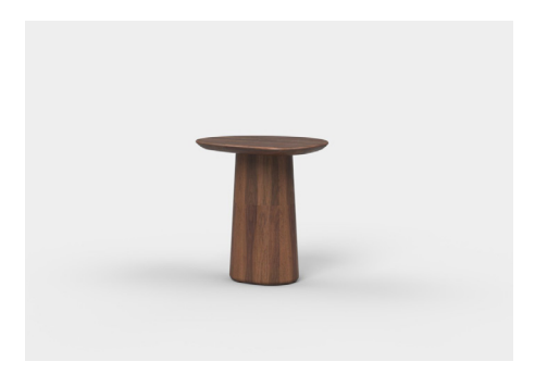
RHY46 - 467L x 379D x 485H (mm) 18L x 15D x 19H (inches)