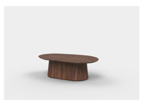
RHY114H - 1147L x 730D x 350H (mm) 45L x 29D x 14H (inches)