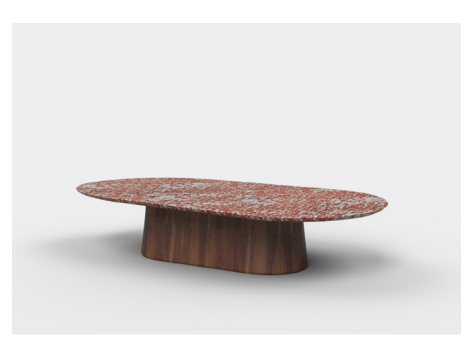
RHY170H_1 - 1707L x 878D x 350H (mm) 67L x 35D x 14H (inches)