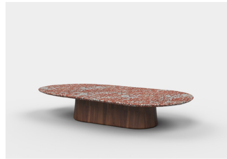
RHY170L_1 — 1707L x 878D x 300H (mm) 67L x 35D x 12H (inches)