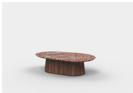
RHY114L_1 – 1147L x 730D x 300H (mm) 45L x 29D x 12H (inches)