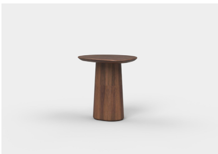
RHY46 – 467L x 379D x 485H (mm) 18L x 15D x 19H (inches)