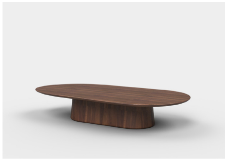
RHY170L — 1707L x 878D x 300H (mm) 67L x 35D x 12H (inches)