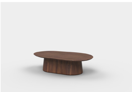
RHY114L – 1147L x 730D x 300H (mm) 45L x 29D x 12H (inches)