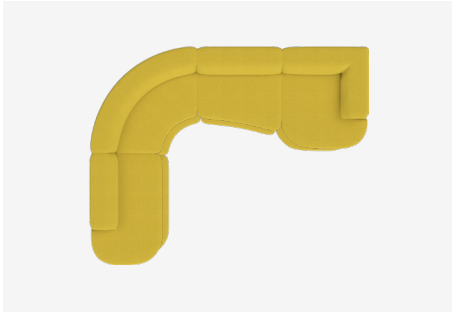
Modular M | NI158L + NI120AR + NI154CA + NI120CHR 3940L x 3040D x 640H x 390SH (mm) 155L x 119D x 25H x 15SH (inches)