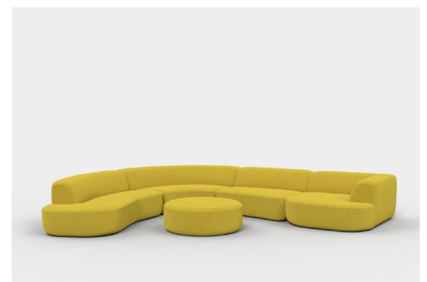
Modular L | NI195L + NI154CA + NI120AR + NI120CHR + NI105P 3940L x 3490D x 640H x 390SH (mm)