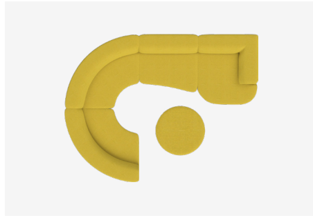
Modular K | NI154CA + NI154CA + NI120AR + NI120CHR + NI105P 3940L x 3080D x 640H x 390SH (mm) 155L x 121D x 25H x 15SH (inches)