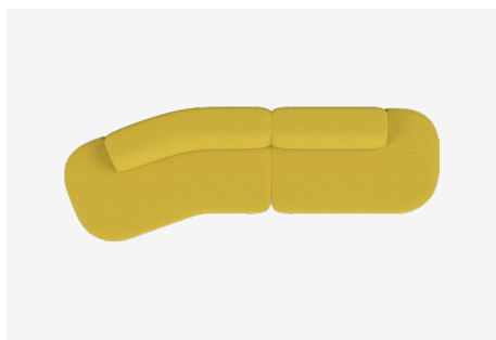
Modular D | NI195L + NI158R 3530L x 1250D x 640H x 390SH (mm) 139L x 49D x 25H x 15SH (inches)