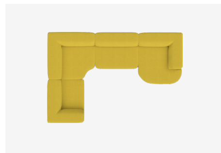
Modular I | NI120L + NI130CA + NI120A + NI120CHR 3700L x 2500D x 640H x 390SH (mm) 146L x 98D x 25H x 15SH (inches)