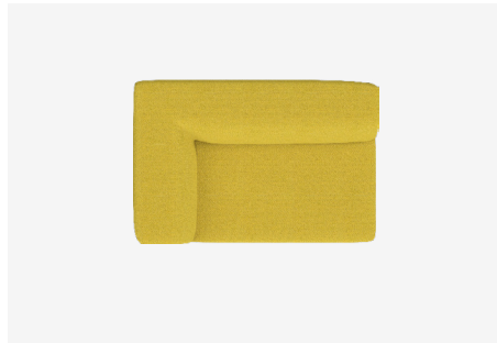
NI150L — 1500L x 1000D x 640H x 390SH (mm) 59L x 39D x 25H x 15SH (inches)