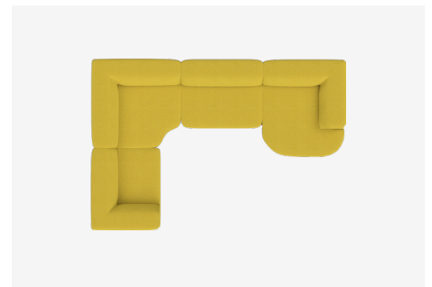
Modular I | NI120L + NI130CA + NI120A + NI120CHR 3700L x 2500D x 640H x 390SH (mm) 146L x 98D x 25H x 15SH (inches)