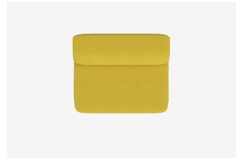
NI120A — 1200L x 1000D x 640H x 390SH (mm) 47L x 39D x 25H x 15SH (inches)