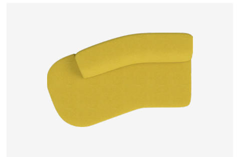
NI195L — 1950L x 1250D x 640H x 390SH (mm) 77L x 49D x 25H x 15SH (inches)