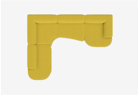
Modular M | NI158L + NI120AR + NI154CA + NI120CHR 3940L x 3040D x 640H x 390SH (mm) 155L x 119D x 25H x 15SH (inches)