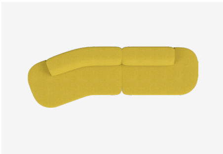
Modular D | NI195L + NI158R 3530L x 1250D x 640H x 390SH (mm) 139L x 49D x 25H x 15SH (inches)