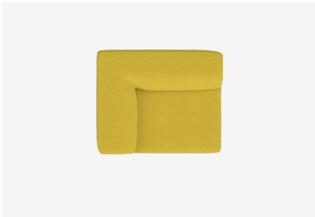
NI120L — 1200L x 1000D x 640H x 390SH (mm) 47L x 39D x 25H x 15SH (inches)