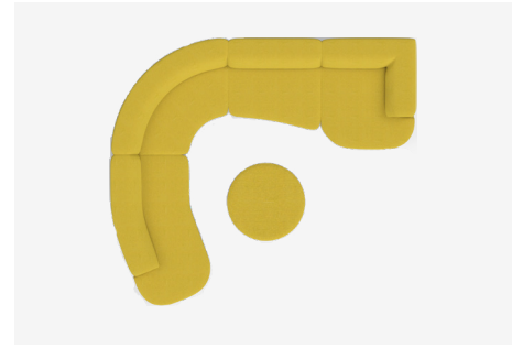
Modular L | NI195L + NI154CA + NI120AR + NI120CHR + NI105P 3940L x 3490D x 640H x 390SH (mm) 155L x 137D x 25H x 15SH (inches)