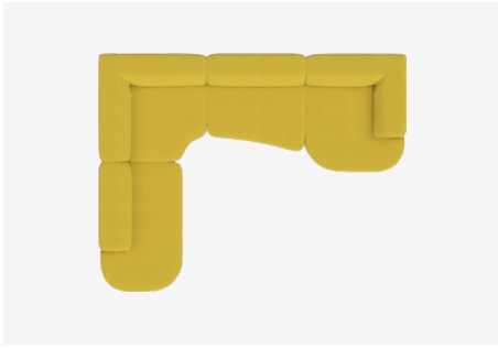
Modular J | NI158L + NI130CA + NI120AR + NI120CHR 3700L x 2880D x 640H x 390SH (mm) 146L x 113D x 25H x 15SH (inches)