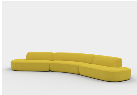
Modular E | NI158L + NI191A + NI158R 4620L x 1620D x 640H x 390SH (mm) 182L x 64D x 25H x 15SH (inches)