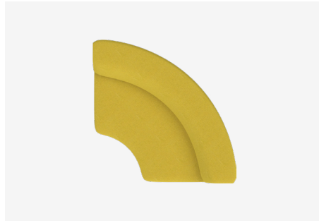
NI154CA — 1540L x 1540D x 640H x 390SH (mm) 61L x 61D x 25H x 15SH (inches)