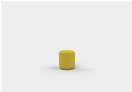
NI40P – 400L x 400D x 450H x 450SH (mm) 16L x 16D x 18H x 18H (inches)