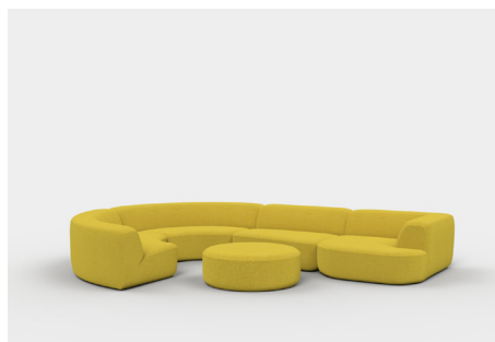
Modular K | NI154CA + NI154CA + NI120AR + NI120CHR + NI105P 3940L x 3080D x 640H x 390SH (mm) 155L x 121D x 25H x 15SH (inches)