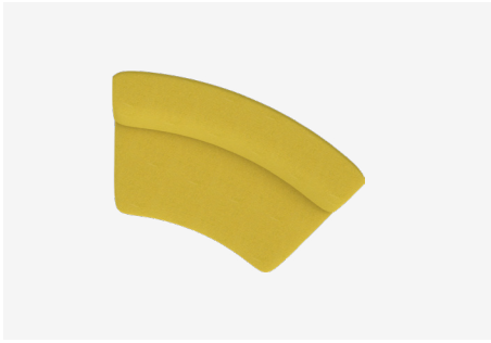
NI191A — 1910L x 1060D x 640H x 390SH (mm) 75L x 42D x 25H x 15SH (inches)