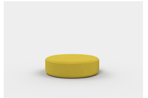
NI120P – 1200L x 1200D x 390H x 390SH (mm) 47L x 47D x 15H x 15SH (inches)