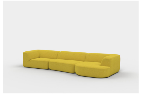
Modular C | NI120L + NI120AR + NI120CHR 3600L x 1450D x 640H x 390SH (mm) 142L x 57D x 25H x 15SH (inches)