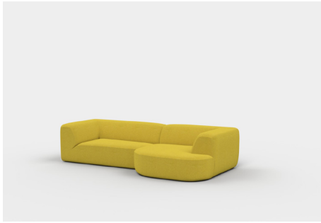
Modular A | NI150L + NI120CHR 2700L x 1450D x 640H x 390SH (mm) 106L x 57D x 25H x 15SH (inches)