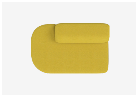
NI158L — 1580L x 1000D x 640H x 390SH (mm) 62L x 39D x 25H x 15SH (inches)