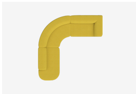
Modular H | NI158L + NI154CA + NI150R 3040L x 3040D x 640H x 390SH (mm) 120L x 120D x 25H x 15SH (inches)