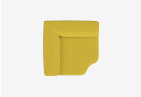
NI130CA — 1300L x 1300D x 670H x 390SH (mm) 51L x 51D x 25H x 15SH (inches)