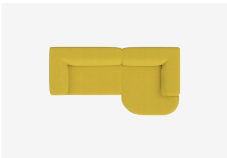
Modular A | NI150L + NI120CHR 2700L x 1450D x 640H x 390SH (mm) 106L x 57D x 25H x 15SH (inches)