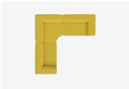
Modular G | NI150L + NI130CA + NI150R 2800L x 2800D x 640H x 390SH (mm) 110L x 110D x 25H x 15SH (inches)