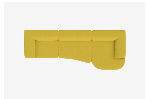
Modular C | NI120L + NI120AR + NI120CHR 3600L x 1450D x 640H x 390SH (mm) 142L x 57D x 25H x 15SH (inches)