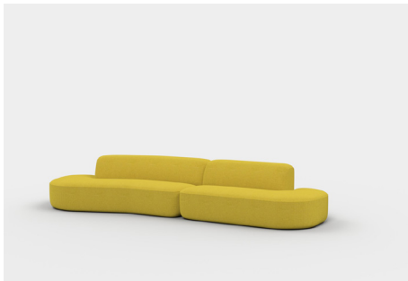
Modular D | NI195L + NI158R 3530L x 1250D x 640H x 390SH (mm) 139L x 49D x 25H x 15SH (inches)