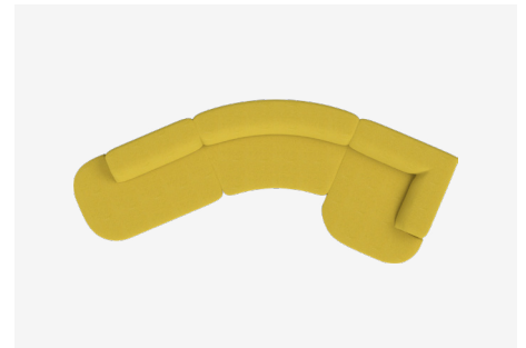
Modular F | NI158L + NI191A + NI120CHR 4330L x 1890D x 640H x 390SH (mm) 170L x 74D x 25H x 15SH (inches)