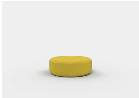
NI105P – 1000L x 1000D x 390H x 390SH (mm) 39L x 39D x 15H x 15SH (inches)