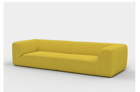
NI270 – 2700L x 1000D x 640H x 390SH (mm) 106L x 39D x 25H x 15SH (inches)