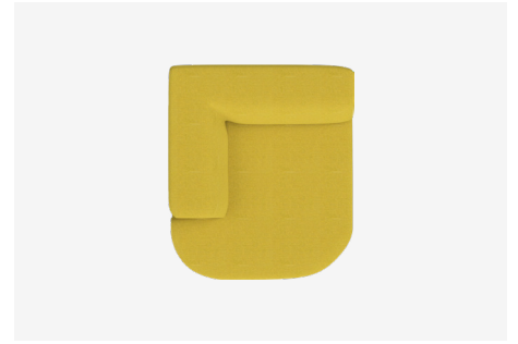
NI120CHL — 1200L x 1450D x 640H x 390SH (mm) 47L x 57D x 25H x 15SH (inches)