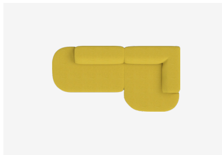
Modular B | NI158L + NI120CHR 2780L x 1450D x 640H x 390SH (mm) 109L x 57D x 25H x 15SH (inches)