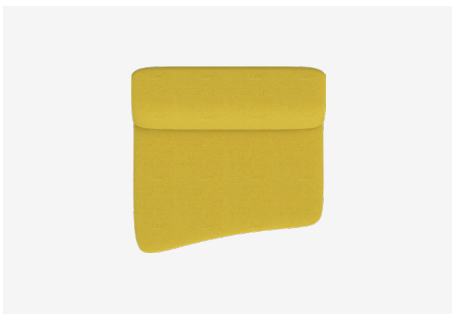
NI120AL — 1200L x 1220D x 640H x 390SH (mm) 47L x 48D x 25H x 15SH (inches)