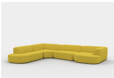
Modular J | NI158L + NI130CA + NI120AR + NI120CHR 3700L x 2880D x 640H x 390SH (mm) 146L x 113D x 25H x 15SH (inches)