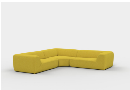
Modular G | NI150L + NI130CA + NI150R 2800L x 2800D x 640H x 390SH (mm) 110L x 110D x 25H x 15SH (inches)