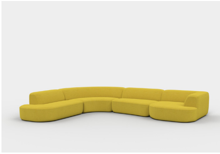
Modular M | NI158L + NI120AR + NI154CA + NI120CHR 3940L x 3040D x 640H x 390SH (mm) 155L x 119D x 25H x 15SH (inches)