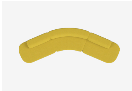
Modular E | NI158L + NI191A + NI158R 4620L x 1620D x 640H x 390SH (mm) 182L x 64D x 25H x 15SH (inches)