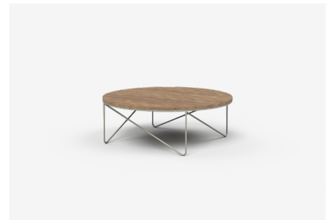
FDCT100L — 1000L x 1000W x 350H