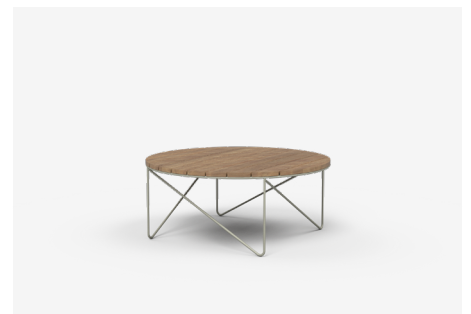
FDCT100H — 1000L x 1000W x 420H