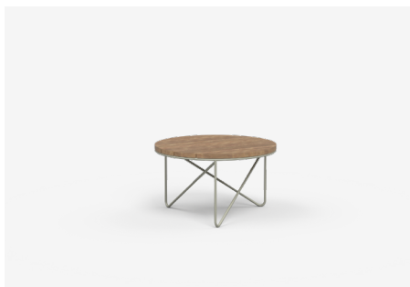
FDCT80H — 800L x 800W x 420H