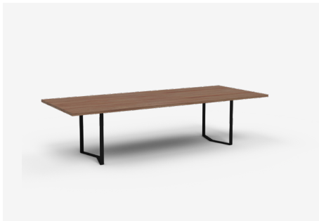
RV300 — 3000L x 100W x 740H (mm) | 10 Seater 118L x 39W x 29H (inches)