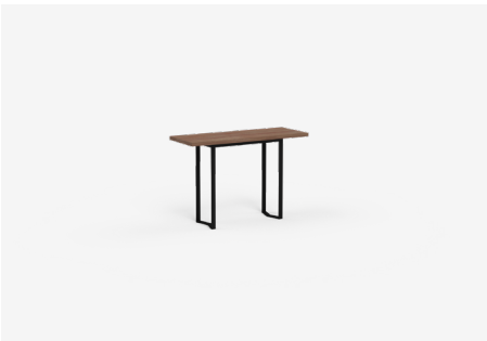
RV120 — 1200L x 450W x 750H (mm) 47L x 18W x 30H (inches)