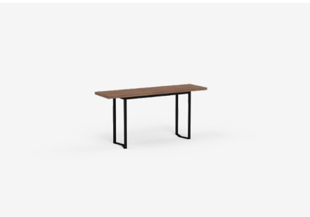
RV160 — 1600L x 450W x 750H (mm) 63L x 18W x 30H (inches)