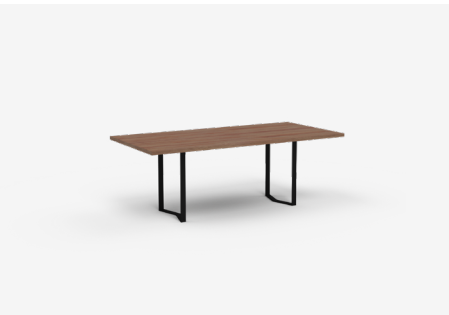
RV210 — 2100L x 100W x 740H (mm) | 6 Seater 83L x 39W x 29H (inches)