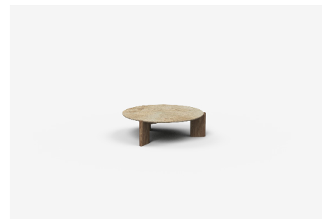
OI100 – 1000L x 1000D x 300H (mm) 39L x 39D x 12H (inches)