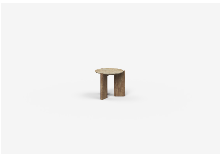
OI50 – 500L x 500D x 450H (mm) 20L x 20D x 18H (inches)