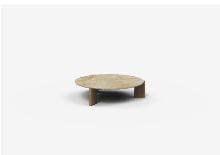
OI120 – 1200L x 1200D x 300H (mm) 47L x 47D x 12H (inches)