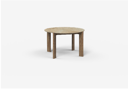
OI120-1 – 1200L x 1200D x 740H (mm) | 4 Seater 47L x 47D x 29H (inches)