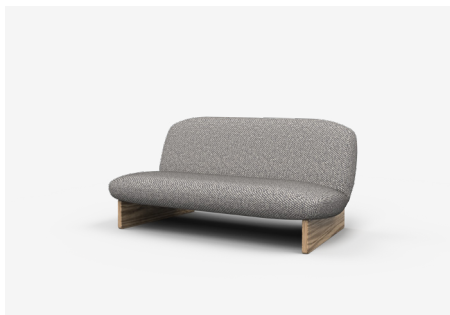
ZG156 – 1560L x 900D x 740H x 420SH (mm) | 2 Seater 61L x 35D x 29H x 17SH (inches)