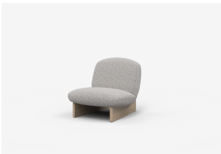
ZG78 – 780L x 900D x 740H x 420SH (mm) 31L x 35D x 29H x 17SH (inches)