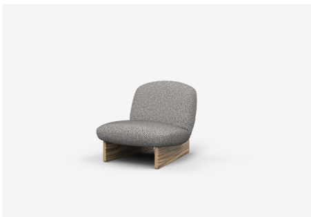
ZG78 – 780L x 900D x 740H x 420SH