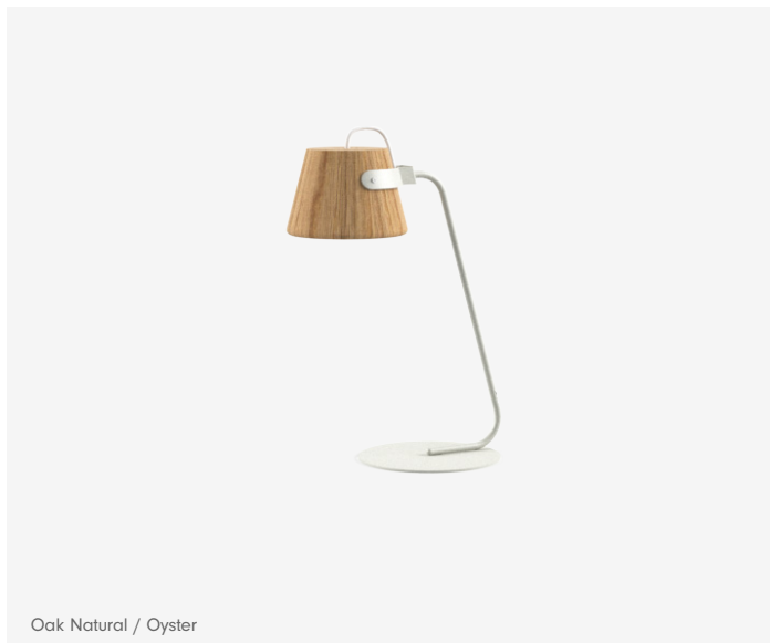
Oak Natural / Oyster