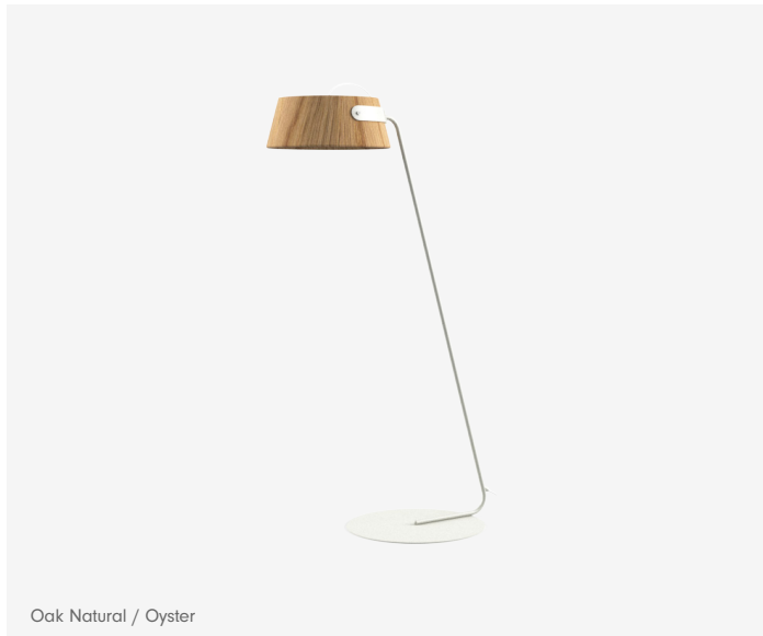
Oak Natural / Oyster