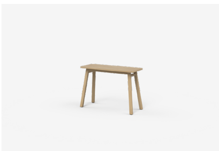
NVCN110 — 1100L x 450D x 740H (mm) 43L x 18D x 29H (inches)