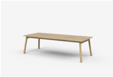
NVD260 — 2600L x 1100D x 740H (mm) | 10 Seater 102L x 43D x 29H (inches)