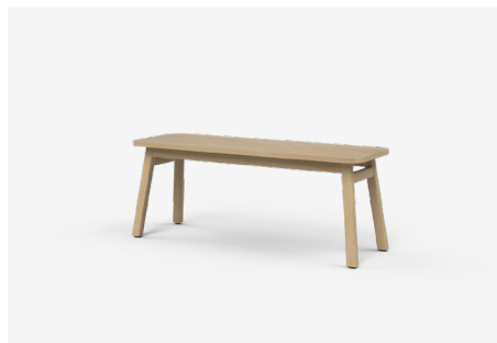
NVBN120 — 1200L x 400D x 460H (mm) 47L x 16D x 18H (inches)