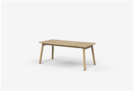
NVD180 — 1800L x 850D x 740H (mm) | 6 Seater 71L x 33D x 29H (inches)