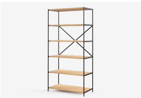
ED100 — 1000L x 490W x 2010H (mm) 39L x 19W x 79H (inches)