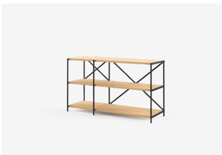
ED151 — 1510L x 490W x 850H (mm) 59L x 19W x 33H (inches)