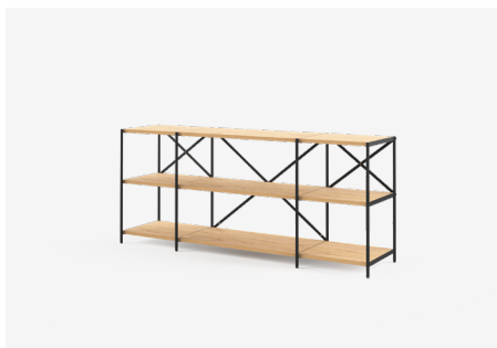
ED202 — 2020L x 490W x 850H (mm) 80L x 19W x 33H (inches)