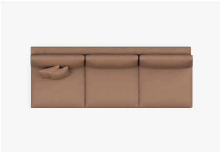
ALF236A — 2360L x 910D x 790H x 400SH (mm) 93L x 36D x 31H x 16SH (inches)