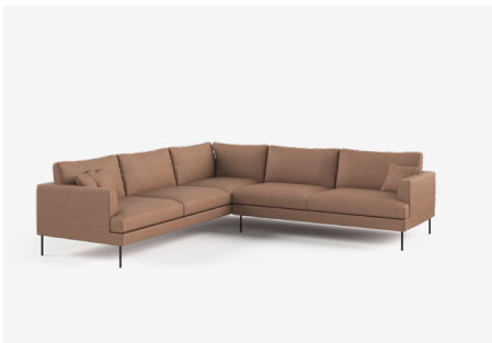
Modular A | ALF261CL + ALF171R 2620L x 2610D x 790H x 400SH (mm) 103L x 103D x 31H x 16SH (inches)