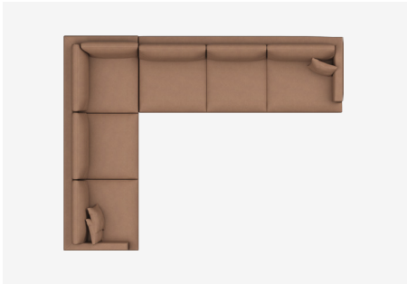
Modular D | ALF261CL + ALF249R 2610L x 3340D x 790H x 400SH (mm) 103L x 134D x 31H x 16SH (inches)