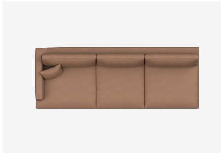
ALF249CL — 2490L x 910D x 790H x 400SH (mm) 98L x 36D x 31H x 16SH (inches)