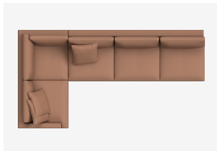
Modular B | ALF183CL + ALF236A 3270L x 1830D x 790H x 400SH (mm) 129L x 72D x 31H x 16SH (inches)