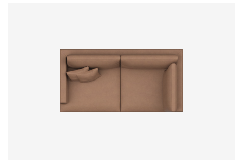
ALF183CL — 1840L x 910D x 790H x 400SH (mm) 73L x 36D x 31H x 16SH (inches)