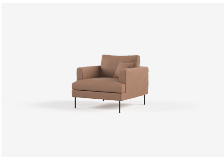
ALF86– 860L x 910D x 790H x 400SH (mm) 34L x 36D x 31H x 16SH (inches)