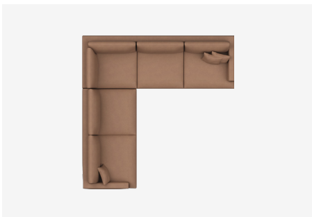
Modular A | ALF261CL + ALF171R 2620L x 2610D x 790H x 400SH (mm) 103L x 103D x 31H x 16SH (inches)