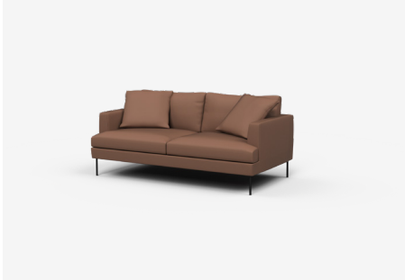
ALF168– 1680L x 910D x 790H x 400SH (mm) | 2.5 Seater 66L x 36D x 31H x 16SH (inches)