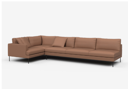
Modular B | ALF183CL + ALF236A 3270L x 1830D x 790H x 400SH (mm) 129L x 72D x 31H x 16SH (inches)