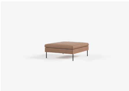
ALF84P – 840L x 900D x 370H (mm) 34L x 36D x 15H (inches)