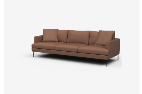
ALF238– 2380L x 910D x 790H x 400SH (mm) | 3.5 Seater 94L x 36D x 32H x 16SH (inches)