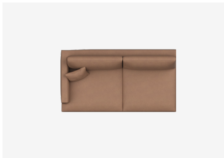
ALF171L — 1720L x 910D x 790H x 400SH (mm) 68L x 36D x 31H x 16SH (inches)