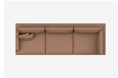
ALF261CL — 2620L x 910D x 790H x 400SH (mm) 103L x 36D x 31H x 16SH (inches)