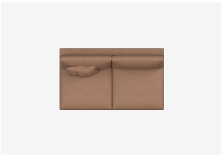
ALF158A — 1590L x 910D x 790H x 400SH (mm) 63L x 36D x 31H x 16SH (inches)