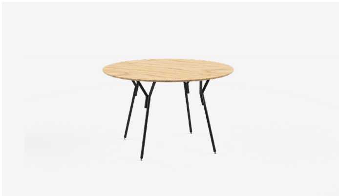
IA120 — 1200L x 1200D x 720H (mm) | 4 Seater 47L x 47D x 28H (inches)