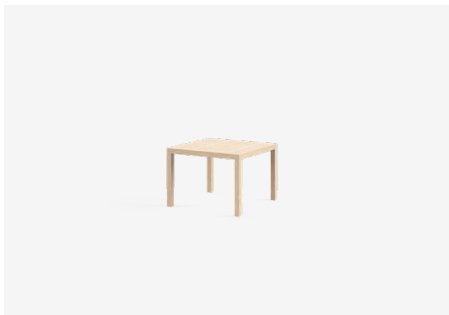
BI56L – 560L x 560W x 400H (mm) 22L x 22W x 16H (inches)