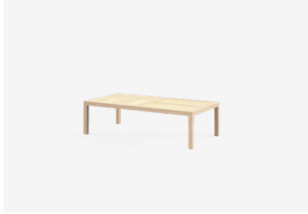
BI100/1 – 1100L x 560W x 300H (mm) 44L x 22W x 12H (inches)