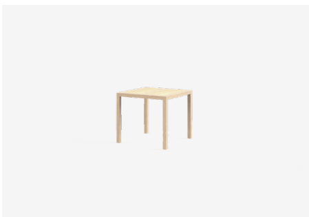
BI56H – 560L x 560W x 500H (mm) 22L x 22W x 20H (inches)