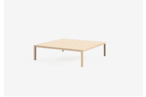
BI100 – 1100L x 1100W x 300H (mm) 44L x 44W x 12H (inches)