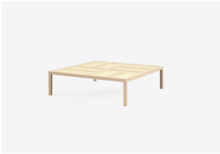
BI100 – 1100L x 1100W x 300H (mm) 44L x 44W x 12H (inches)