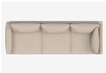
ER257CL – 2570L x 880D x 1130H x 400SH