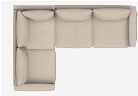
Modular A | ER180CL + ER169R 2570L x 1800D x 850H x 400SH