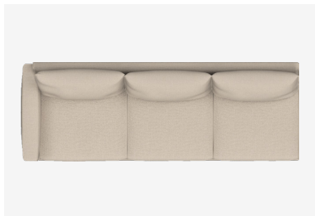
ER245L – 2450L x 880D x 850H x 400SH