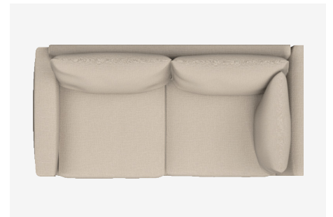
ER180CL – 1800L x 880D x 850H x 400SH