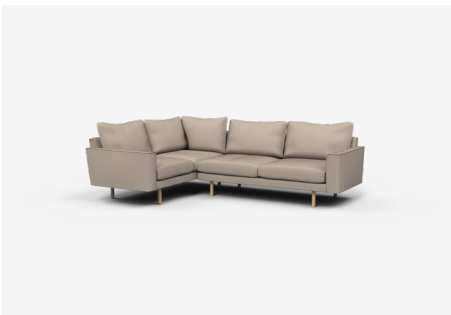
Modular A | ER180CL + ER169R 2570L x 1800D x 850H x 400SH