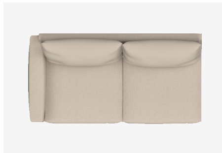
ER169L – 1690L x 880D x 850H x 400SH