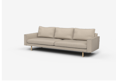
ER261D-2 – 2610L x 1130D x 850H x 400SH | 3.5 Seater