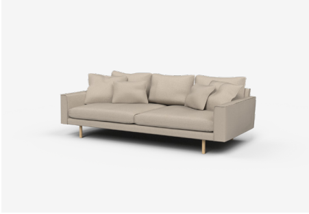
ER243D – 2430L x 1130D x 1130H x 400SH | 3 Seater