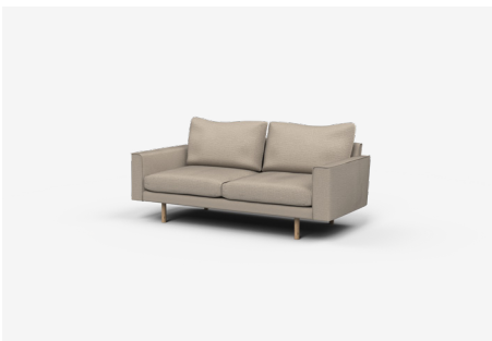
ER185 — 1850L x 880D x 850H x 400SH | 2.5 Seater