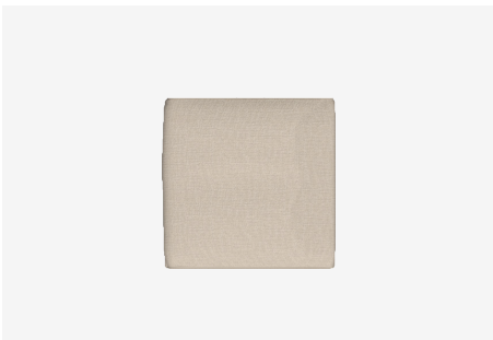
ER78P – 780L x 780D x 400H