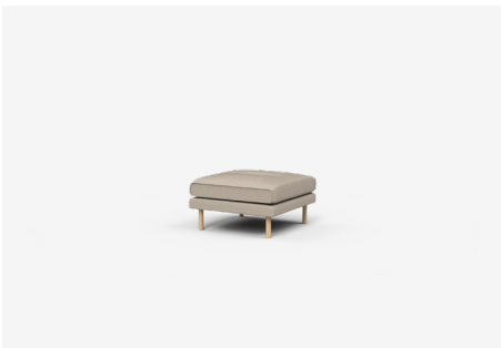
ER78P — 780L x 780D x 400H