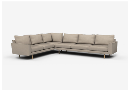
Modular B | ER257CL + ER245R 2570L x 3300D x 850H x 400SH