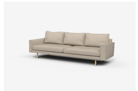
ER261-2 — 2610L x 880D x 850H x 400SH | 3.5 Seater