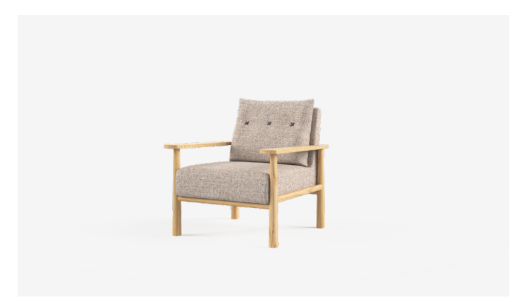
AC76 - 760L \times 820D \times 800H \times 420SH (mm) 30L \times 32D \times 32H \times 17SH (inches)