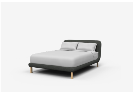
ADB178 — 1780L x 2330W x 990H (mm) | Queen 70L x 92W x 39H (inches)