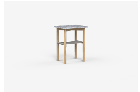
TC50H – 500L x 400D x 650H