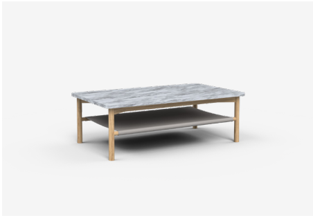
TC120 — 1200L x 700D x 400H