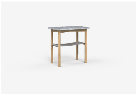
TC65H – 650 x 400D x 650H