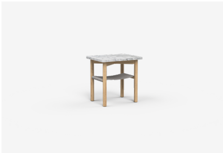
TC50 – 500L x 400D x 500H