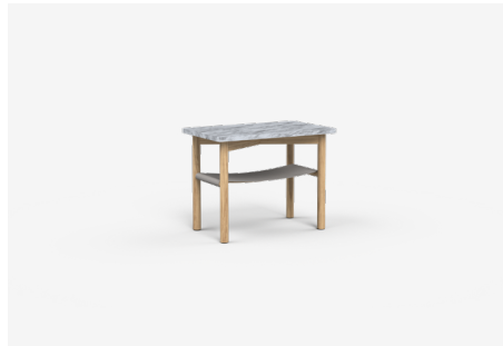
TC65 – 650L x 400D x 500H